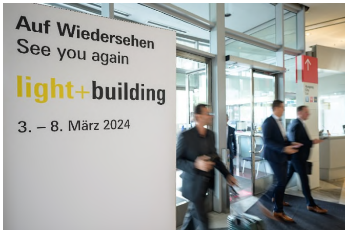
Satisfied visitors express their intention to return to Light + Building 2024.